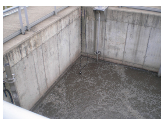
Figure 1: IQ Sensor Net VARiON® sensor in Anoxic Tank

The tool needs to be inexpensive. It is important that the acquisition cost be comparable with other tools to fit into the budget. It is also important that ownership cost is low to not significantly increase the annual operating expenses. Furthermore, many wastewater facilities are small facilities serving institutions that also have a limited budget. Even better is a tool that pays for itself by enabling reduced O&M costs for energy or chemical inputs.