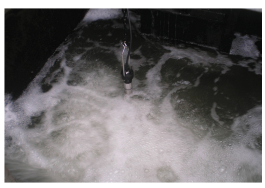
Figure 2: IQ SENSOR NET VARION® sensor in Final Effluent